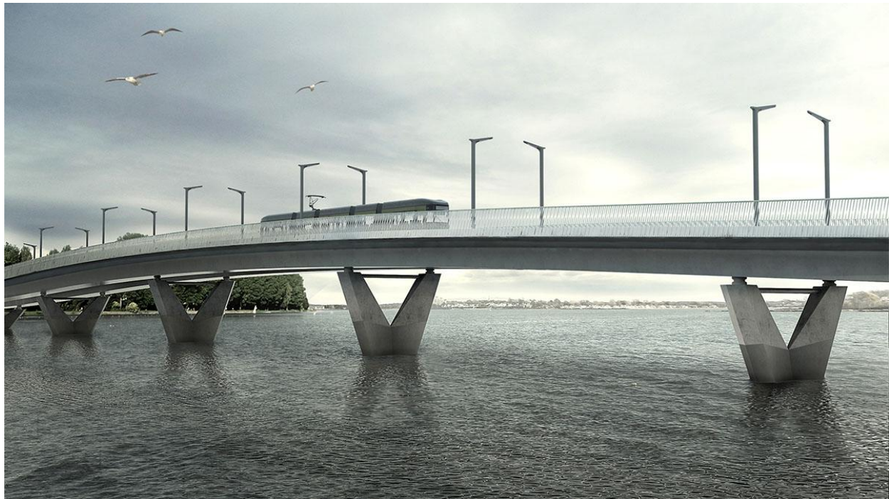
Artist's view of completed Finkensilta