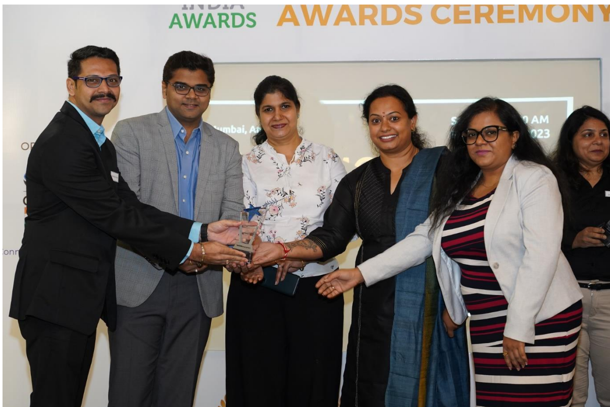
VMware Software Team- Finalist of the PMO of the Year Award for 2022