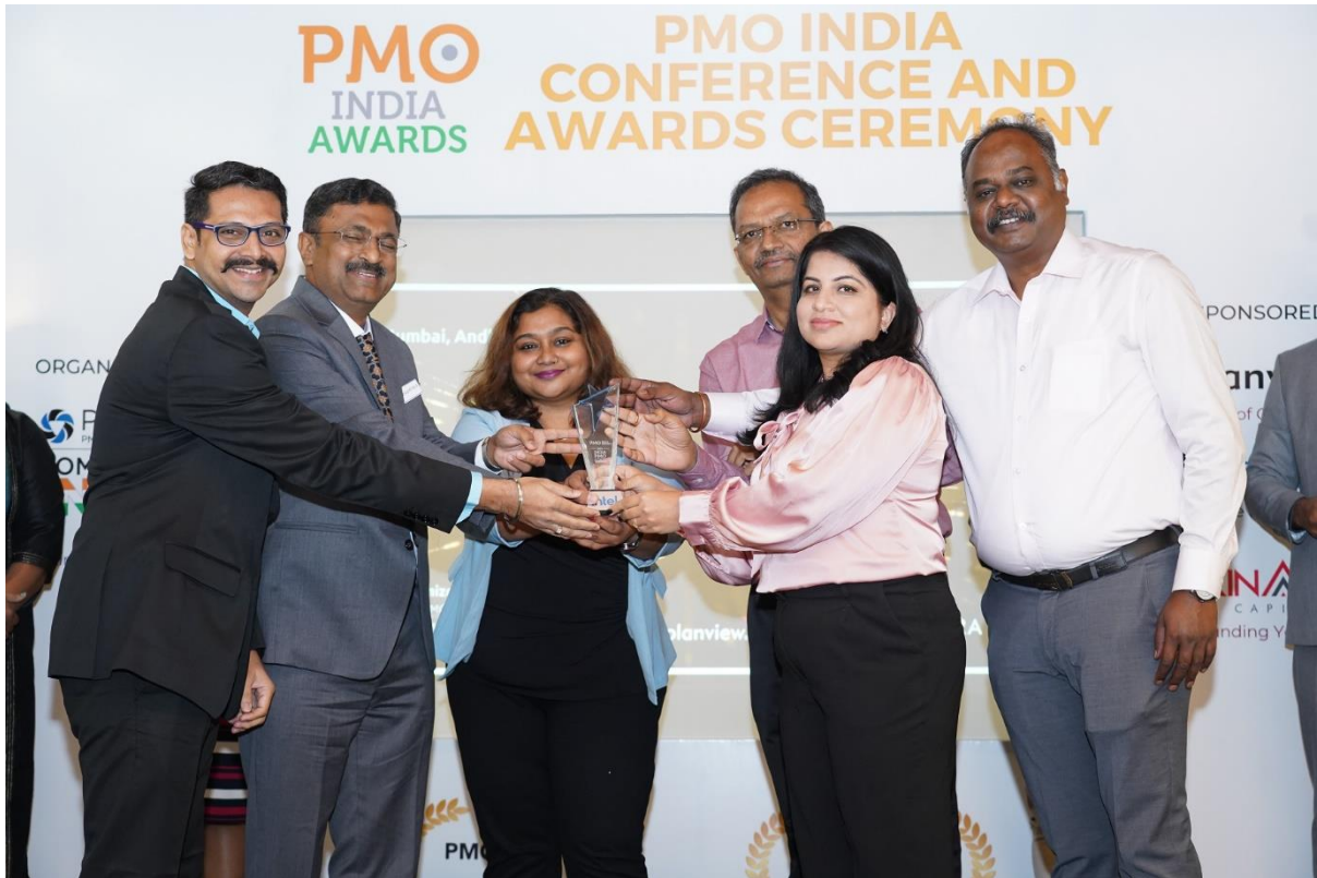
Intel Technology Team- Finalist of the PMO of the Year Award for 2022

The Winner and the finalists shared their thoughts and expressed their happiness, sense of achievement throughout the journey and during the ceremony.